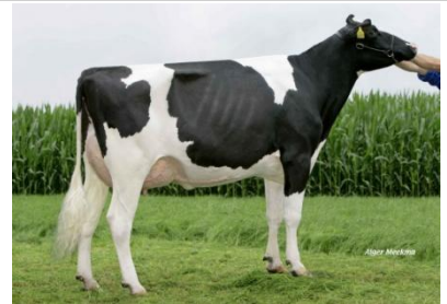
Zandenburg Planet Ebony 3 VG-87-NL 2yr. | Full sister to dam