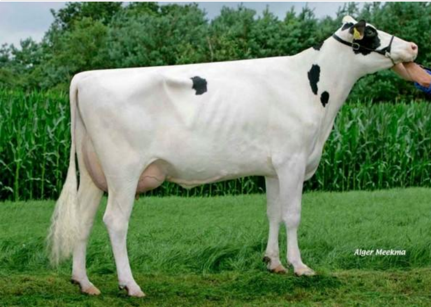
Zandenburg Planet Ebony VG-86-NL 2yr.

Family to :Rocky-Vu Rotate Exctasy Ebony EX-94-USA 4yr. GMD DOM