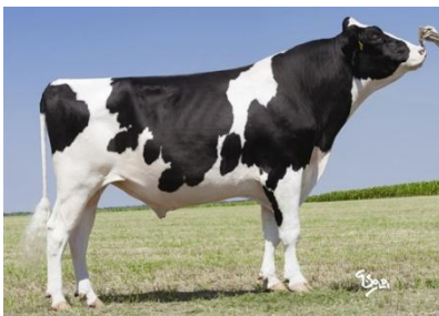
AMIGHETTI NUMERO UNO ET